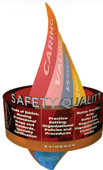
Model Representing Regulation of Professional Nursing Practice